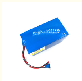
Battery Pack: 48V 40Ah