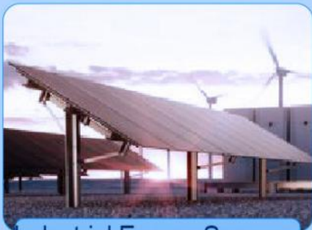
Industrial Energy Storage