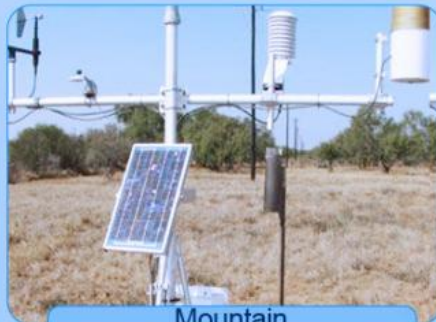
Mountain Communicationbase Station