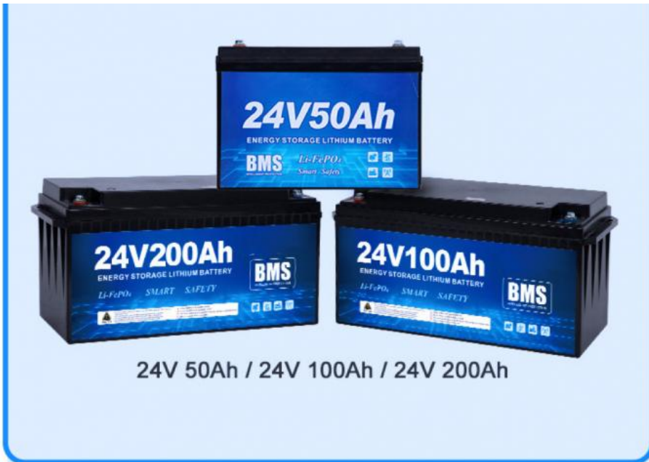
24V 50Ah / 24V 100Ah / 24V 200Ah