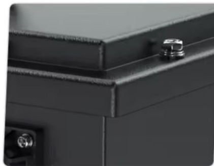
Metal material is more sturdy