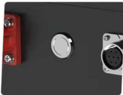
Intelligent one-button control ON/OFF