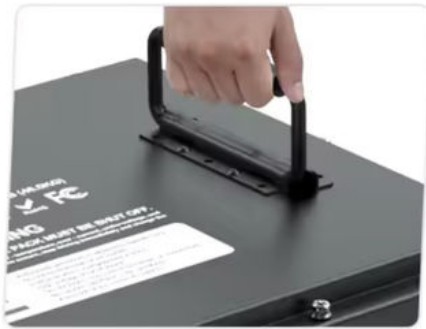
Easy to carry with handles