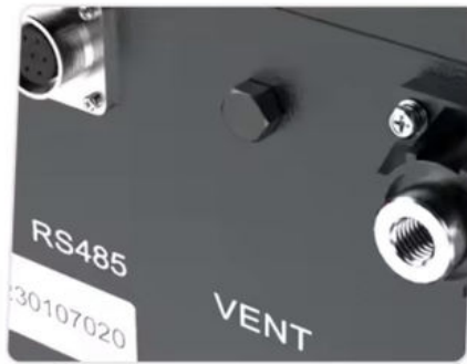
Help to vent internal gases